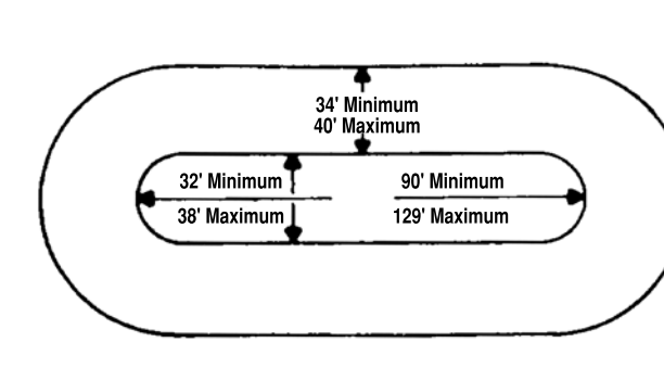
Diagram 3-1: Track Layout